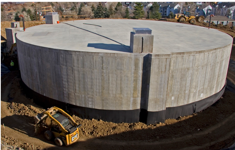
New 1 million gallon water storage reservoir near Warren Tech dwarfs construction vehicles working on the project.

You can call the District office at 303-985-1581 for further information on these programs.