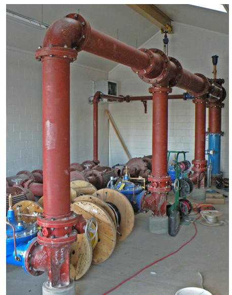
New pump station will help supply water to St. Anthony's Hospital.